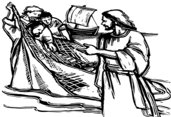
Jesus called out to them, "Come, follow me, and I will show you how to fish for people!" Matthew 4:19 (NLT)